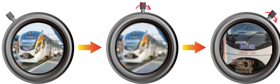
Vari-Focal lens for available focal lengths

The ICA-5550V incorporates the mega-pixel vari-focal lens, which has the option of selecting a high millimeter setting for narrow viewing fields or a low millimeter setting for wider viewing fields. The ICA-5550V provides three individually configurable motion detection zones. The camera can record video or trigger alarms or alerts when camera image is tampered.