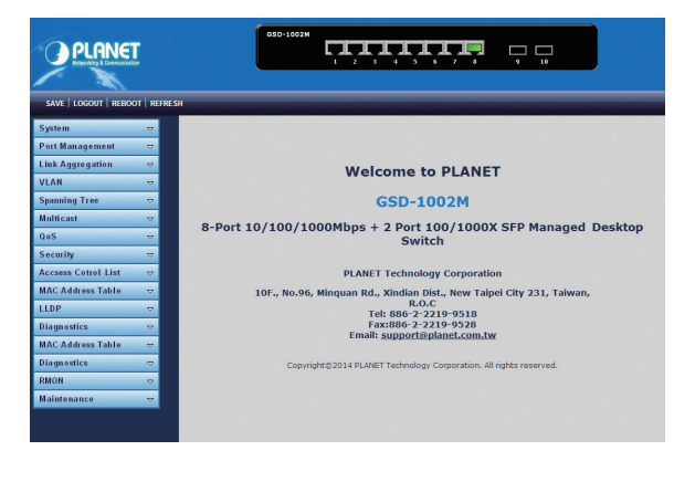
Figure 3-3: Web Main Screen of Managed Switch

3. After entering the password, the main screen appears as Figure 3-3 shows.