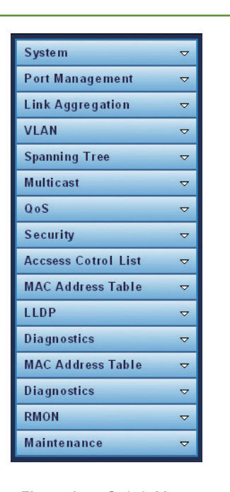
Figure 3-4: Switch Menu

Now, you can use the Web management interface to continue the Switch management.