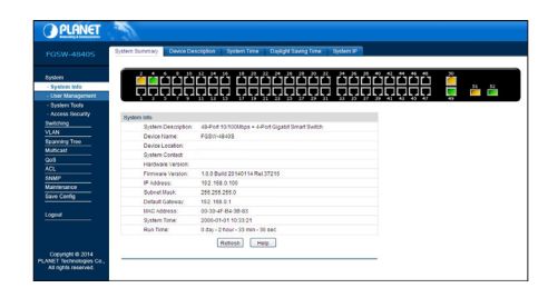
Figure 3-3: Web Main Screen of Managed Switch

The Switch Menu on the left of the Web page lets you access all the commands and statistics the Managed Switch provides.