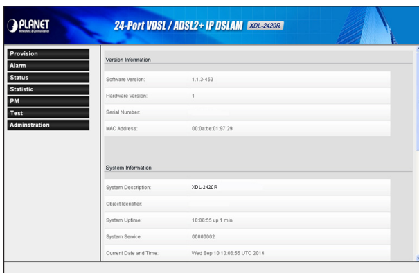
Figure 3-3: Web Main Screen of IP DSLAM

3. After entering the password, the main screen appears as Figure 3-3 shows.