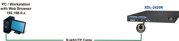
Figure 3-1: IP Management Diagram

For example, the default IP address of the IP DSLAM is 192.168.0.100 , then the manager PC should be set at 192.168.0.x (where x is a number between 1 and 254, except 100), and the default subnet mask is 255.255.255.0.